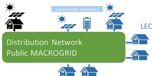
Figure 3 Implementation solution 2 for EC-network